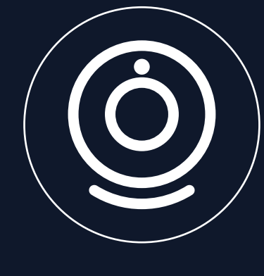
Front 5M Rear 13M