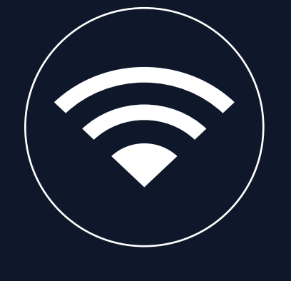
dual band WIFI